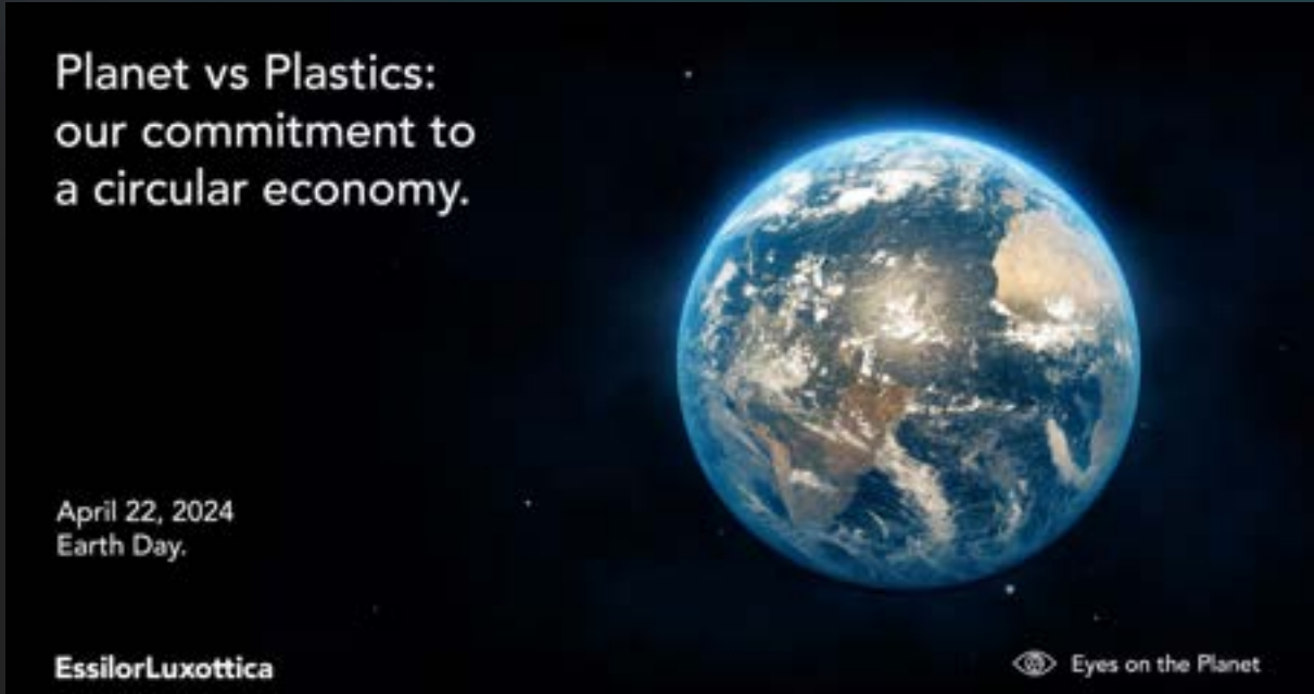
2024 Sustainability week