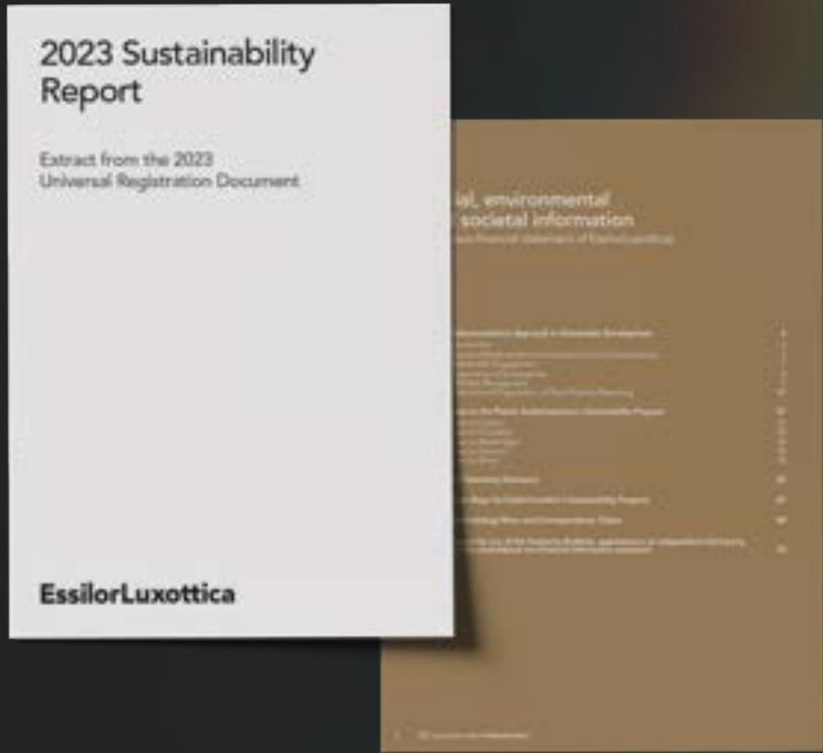
2023 Sustainability Report