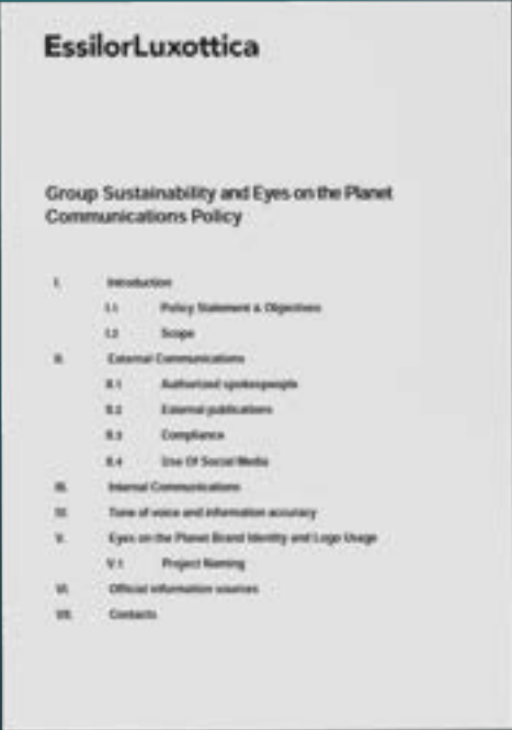
Group Sustainability communication policy