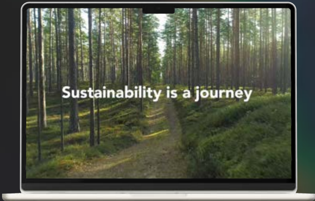
Eyes on The Planet video